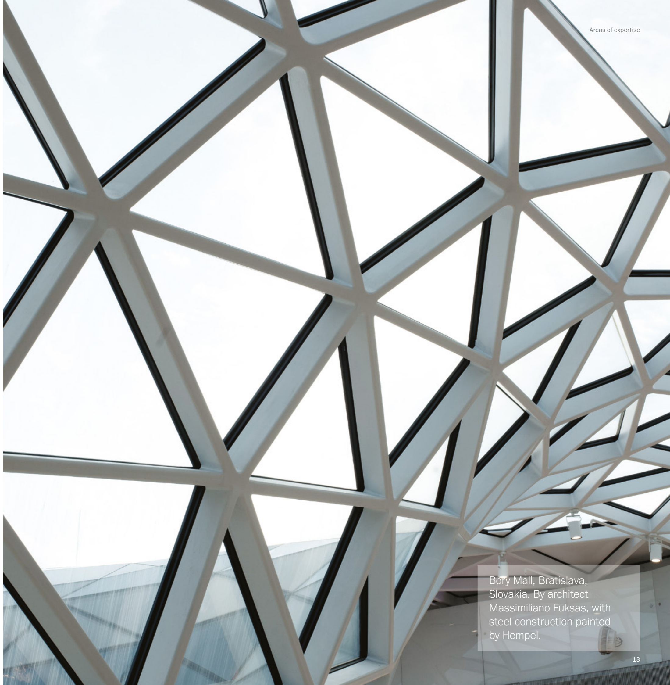
Bory Mall, Bratislava, Slovakia. By architect Massimiliano Fuksas, with steel construction painted by Hempel.